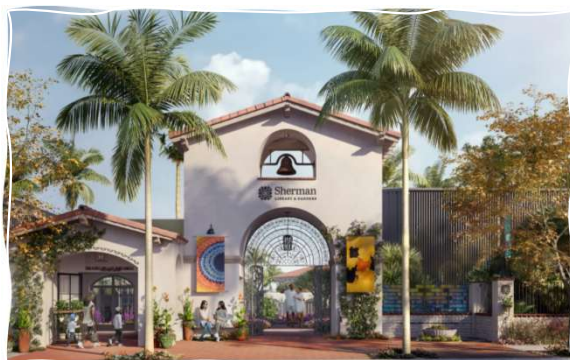
Sherman Library and Gardens